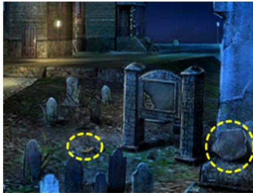
Inscription part Flat rock

58. Tap with a stylus on the objects encircled yellow on the lower screen to collect them.